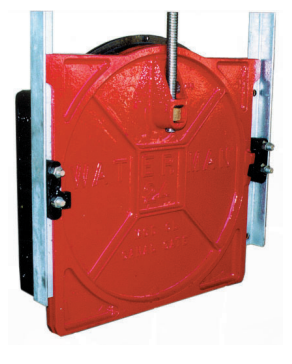
Shown with optional threaded thrust nut for true non-rising stem operation

Waterman CL-10 Canal Gates are identical to our model C-10 Gates with the exception of the cast iron cover (slide) which is of a flat plate type construction with ribs reinforcing its face, to withstand the maximum heads as noted for our C-10 gates. This gate cover also features a square bottom design, which allows a more open "clog-free" flow at points of initial opening. The seat being only slightly raised above the cover plate surface helps prevent trash from collecting behind the cover which can cause difficulty in operation. Available with threaded thrust nut for true NRS application. All parts are interchangeable with our Standard C-10 gate. Available in a variety of sizes, consult factory.